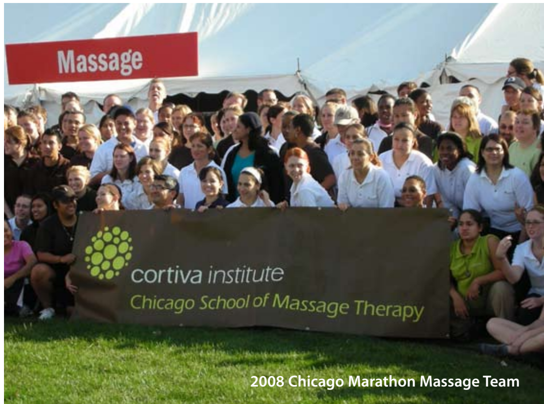
2008 Chicago Marathon Massage Team

Mark your calendar and watch the Cortiva website and your email for more details as they become available!